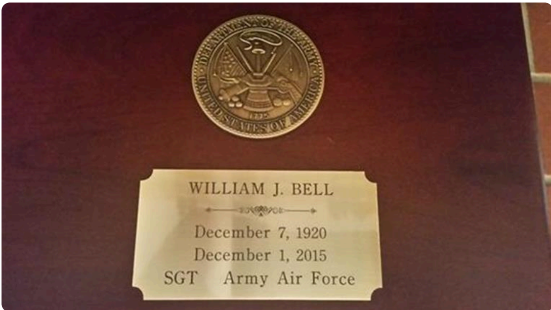
The top of the lid.