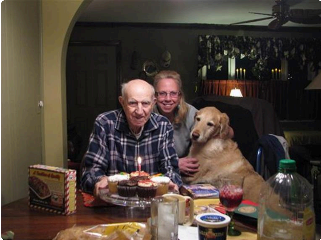
December 7, 2014 Your last Birthday. Age 94